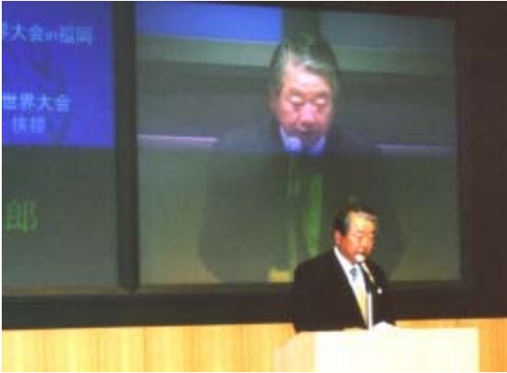
Mr. Hirotaro Yamasaki, Mayor of Fukuoka City