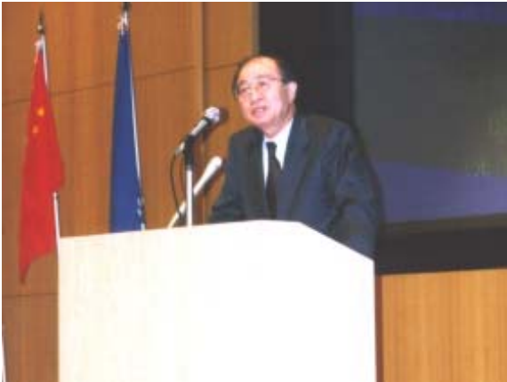
Mr. Yasushi Akashi, Chairman, Japan Centre for Preventive Diplomacy